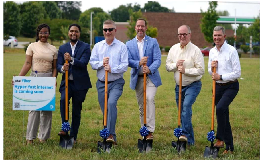
AT&T Broadband Expansion Groundbreaking Event

73,000 Households or individuals directly benefited from ARPA funded programs to date