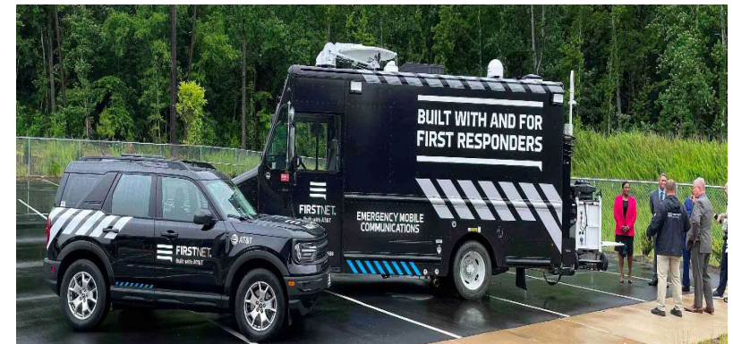
FirstNet mobile unit on display at community event.