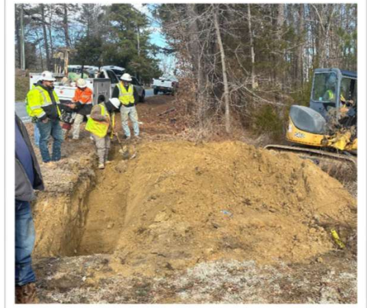
Pinecroft Sedgefield Fire District installing fire hydrants