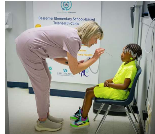
Certified medical assistant at Bessmer Elementary