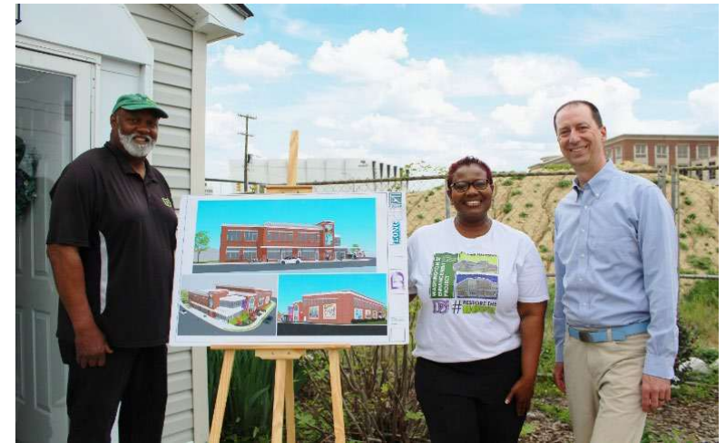
Washington Street Final Plans