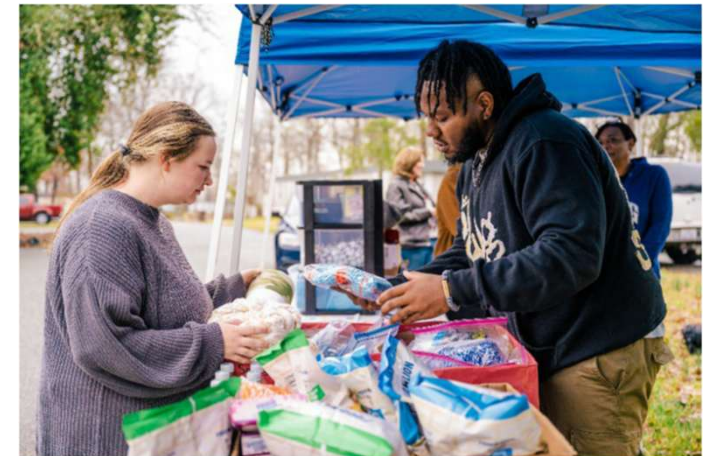
Food giveaway at a GCSTOP Community Supply Distribution Event