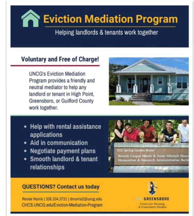
Eviction Mediation clinic handout